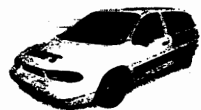
Free Pick-up & Delivery

More than 1000 locations worldwide. For the location nearest you, call 1-800-2-KINKOS. Visit our Website at www.kinkos.com.